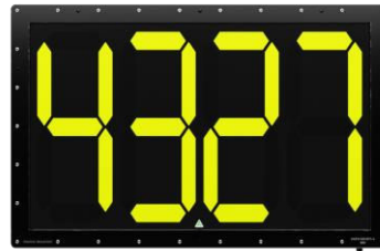
4 Number Changeable Display. Part No. RBM577-4