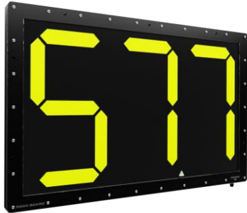
3 Number Changeable Display. Part No. RBM577

Accessories: Pair with Handrail Mounting Kit (Part No. BP15HD) and mount to the handrails of Diggers, Drills, & Loaders.